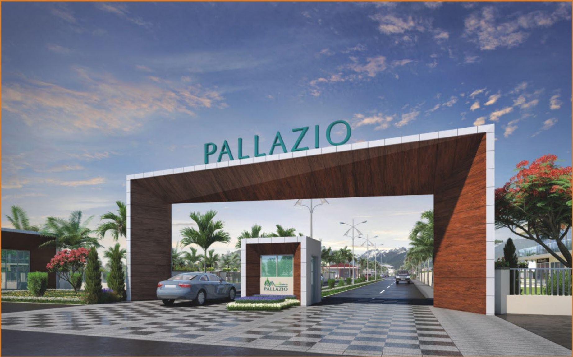
ENTRANCE VIEW - 3D