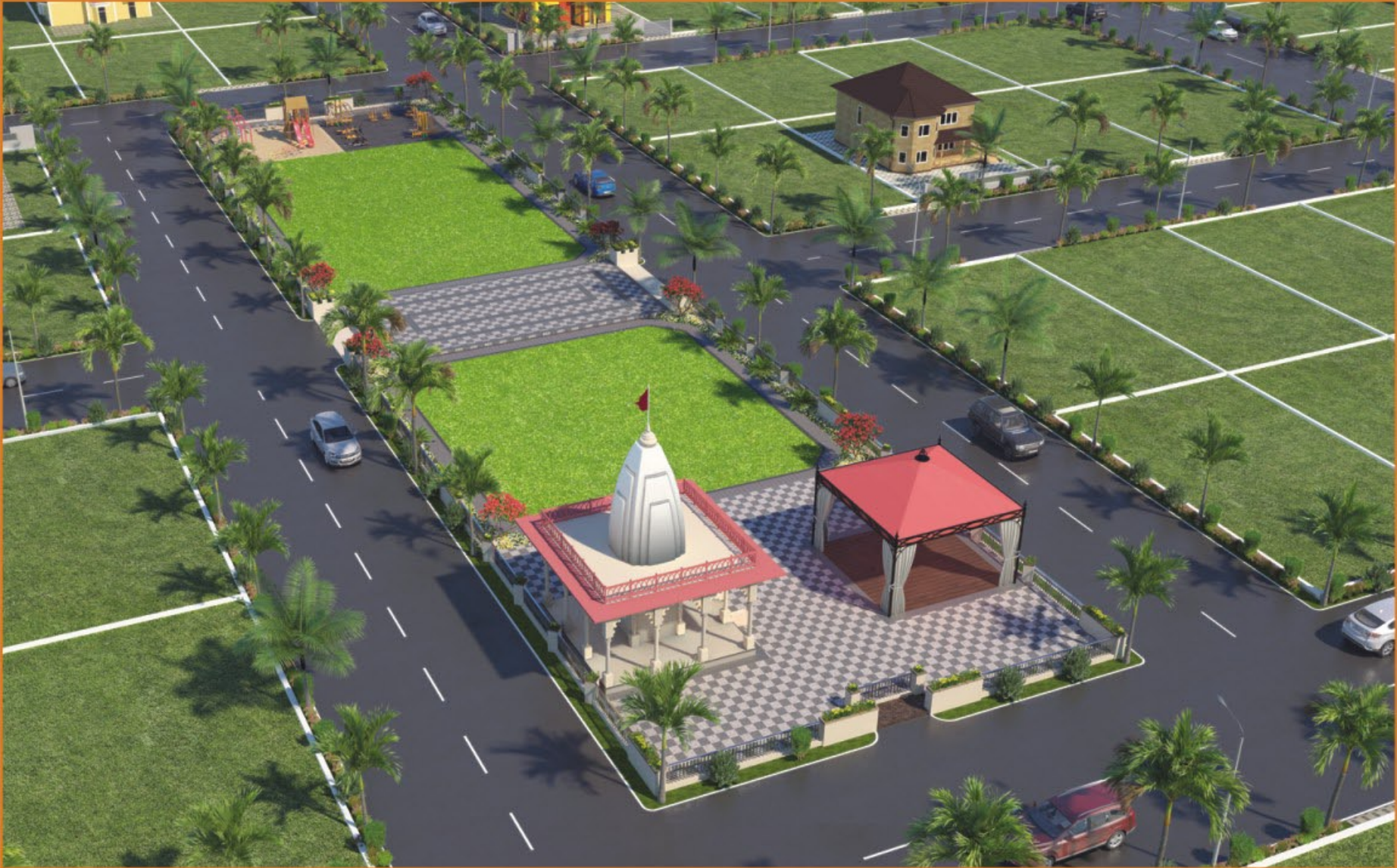
TEMPLE & PARK VIEW - 3D